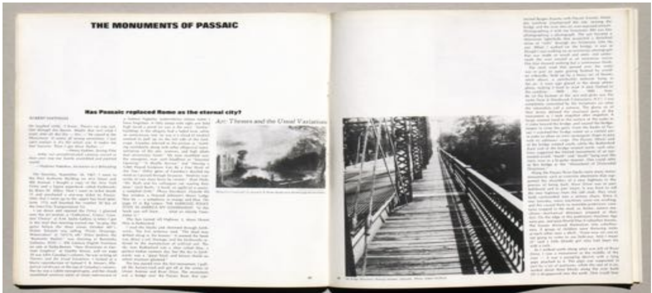
Fig. 5. Robert Smithson, opening spread from ‘The Monuments of Passaic: Has Passaic replaced Rome as the eternal city?’, Artforum , December 1967. Note, in the newspaper cut-out on the l.h. page, the original caption has been included beneath the historical landscape painting.

eternal city. In his visual essay The Monuments of Passaic (1967), the artist opens with an image he'd spotted, printed in that day's New York Times . Entitled Allegorical Landscape (1836), this anaemic painting is by Samuel Morse, a painter idealizing the landscape in America around the time the Posillipo School was busy concocting theirs. Like Di Matteo, Smithson deliberately includes the caption printed beneath this picture, to underscore its nature as a reproduction. The image's inky, barely decipherable contours further remove the picture from whatever 'truth' rests within this painting – a 'truth' which, as Smithson points out,