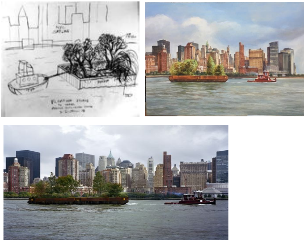
Fig. 6. Three versions of Floating Island to Travel Around Manhattan Island, New York NY . Drawing by Robert Smithson, 1970; painting from Land Art from My Balcony by Gabriele Di Matteo, 2018; realization by Minetta Brooks/the Whitney Museum of American Art, 2005.

century re-make. So which is the ‘real’ artwork? A visionary sketch by the artist? Or a three-dimensional artwork, posthumously created? Or perhaps DiMatteo’s painting of a photograph of an artwork imagined from a drawing? In the words of Hito Steyerl (who, perhaps, has taken Smithson’s place today as our most gifted and imaginative artist/writer): ‘One could argue that this is not the real thing, but then—please, anybody—show me this real thing.’ Is an unrecognisable, early religious painting in Smithson’s hand more or less a ‘real’ Smithson than his signature Spiral Jetty , constructed by earthmoving machines? Photography once seemed to hold some special purchase on the ‘real’, but this has long been thrown into doubt. Painting – with its slow-time fabrication and deliberateness – can seem a more authentic art object; and for some, still pining for the days of pre-Conceptualism, painting will always feel more like ‘real art’.